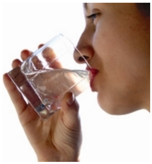
Water helps keep the body at optimum health.

risk of colon cancer, bladder cancer, and potentially even breast cancer.